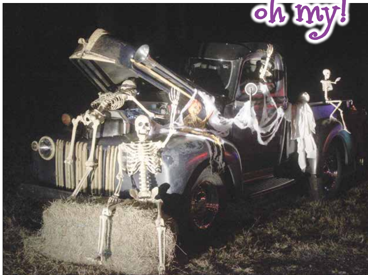
An abandoned truck had a haunted horn going off on its own.