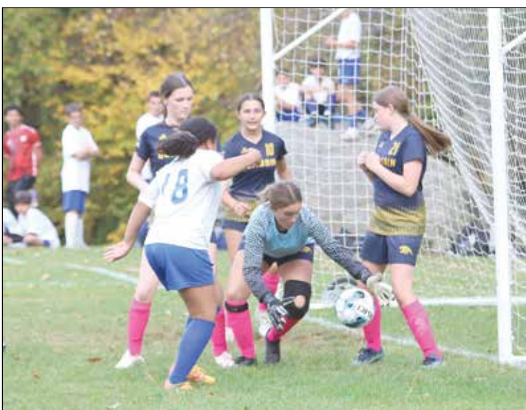
The Quabbin defense tries to guard against a goal.