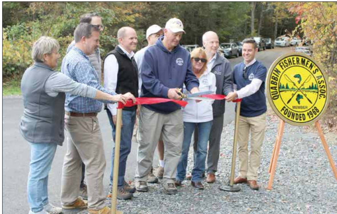
The Department Conservation and Recreation held a ribbon cutting ceremony at newly rehabilitated access road at Quabbin Reservoir's Gate 43.