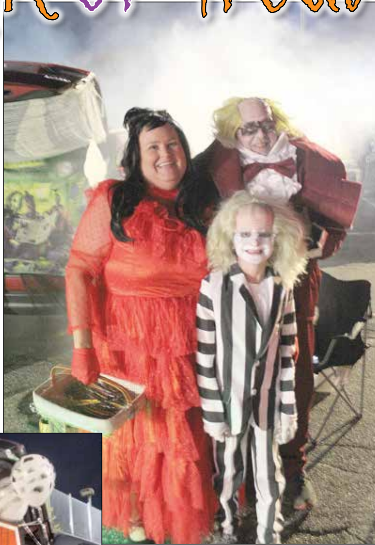
Turley

In addition to volunteers from local businesses around the community, school staff and