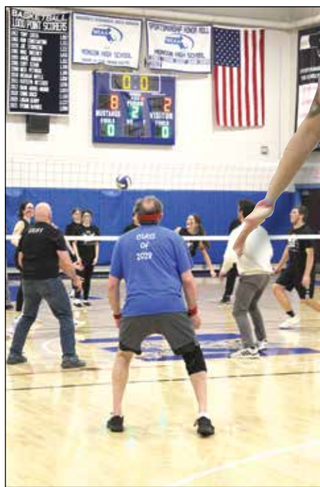
Faculty members faced off against the junior class in the final event of the Winter Carnival.