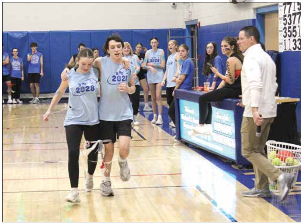
Students dashed across the gymnasium to compete against their classmates in the three-legged race.

All that practice paid off when it was time for these Class of 2025 students to participate in the three-legged race.