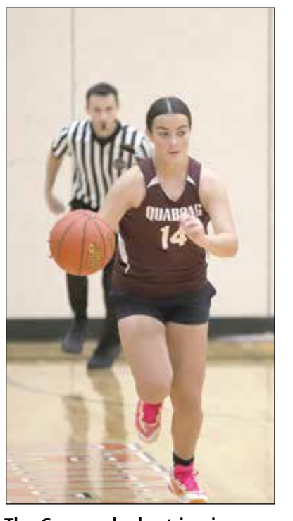
The Cougars had a tri-scrimmage last week with Granby and host Belchertown.

Their home opener is on Dec. 18 against Southbridge.