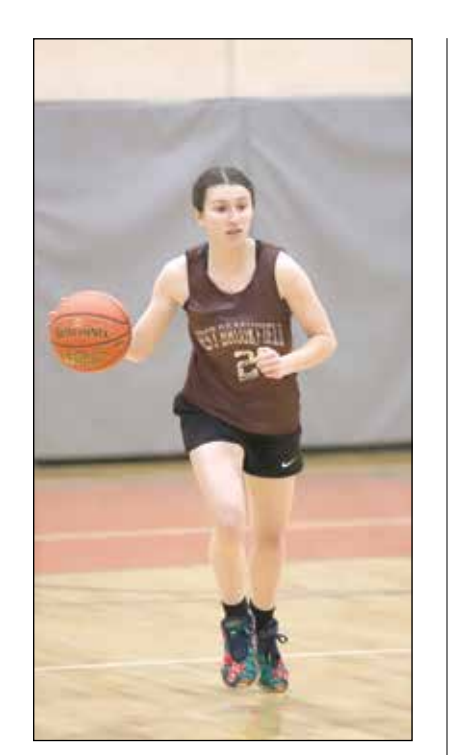
Quaboag is on the road for their first three games.