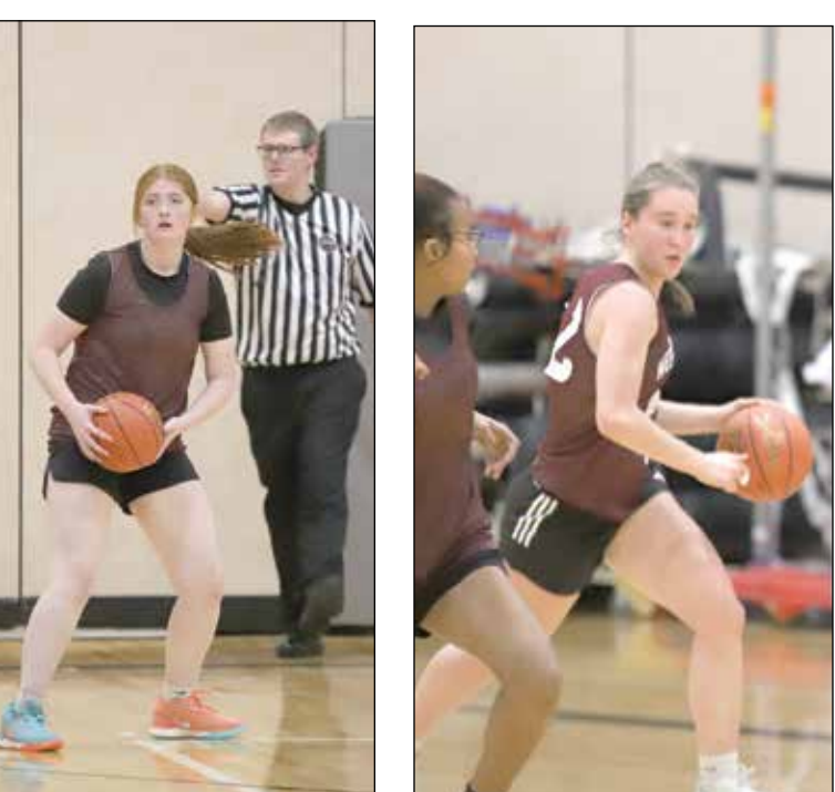
The Cougars opened up their season later in the week.