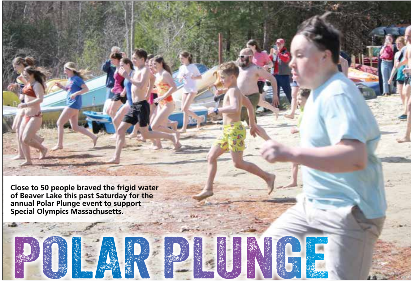
Close to 50 people braved the frigid water of Beaver Lake this past Saturday for the annual Polar Plunge event to support Special Olympics Massachusetts.