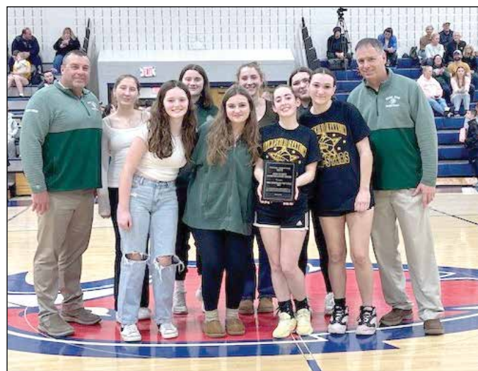
The Ware girls basketball team were the 2025 recipients of the Jack Leaman Sportsmanship Award.