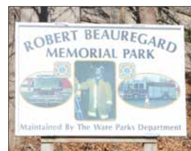
Volunteers have been focusing on revitalizing the Robert Beaugard Memorial Park, also known as Ware Dreams Come True playground.