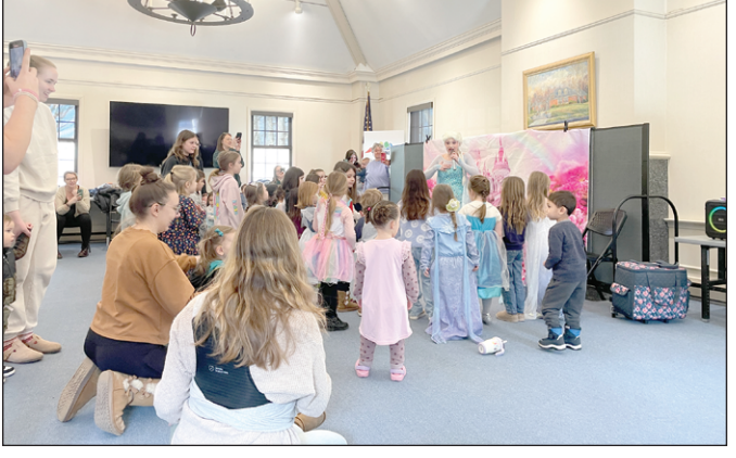
The Snow Queen sings "Let It Go" with all of the children.

"We wanted to go to the Wilbraham library today to spread our company to all little boys and girls so they can feel the magic of meeting their favorite princess. From what I had done with the library they seemed consider-