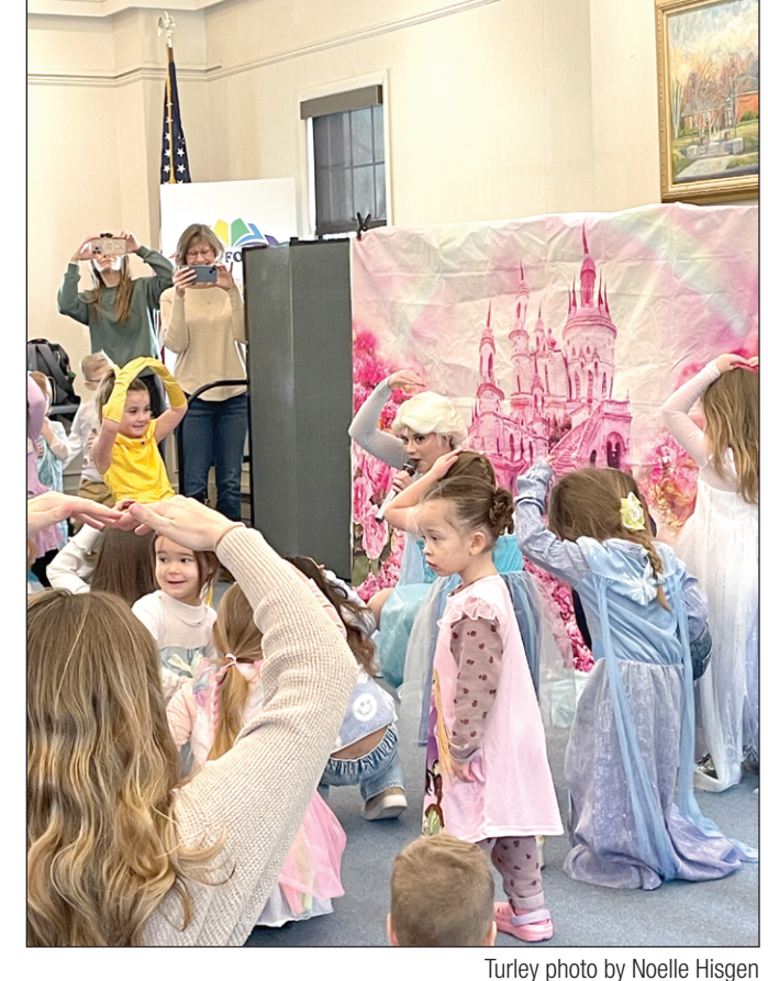
A game of freeze dance is played and everyone pretends to be a snowman.

For the month of March for the library, upcoming children's events include a Dried Bean Mosaic event on March 8 where kids can make a mosaic out of various beans and seeds. Also, a Beary Special Storytime on March 31, for a fun day of arts and crafts with their teddy bears.