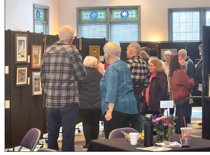
Attendees check out the artwork during the Big Art Show of Small Works hosted by the Scantic River Artisans in Hampden.