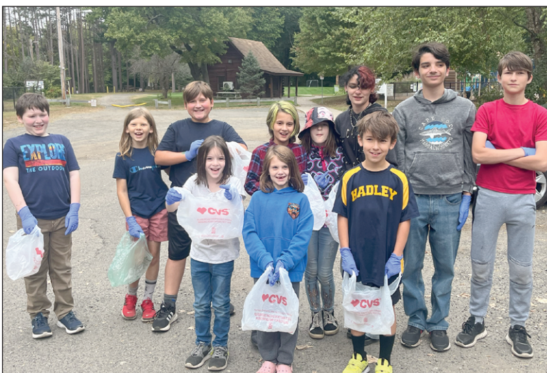
The kids are eager to go and start collecting trash, holding up their bags with gloves on.

Despite what most public opinion or belief of homeschooling, there is more opportunity than one would