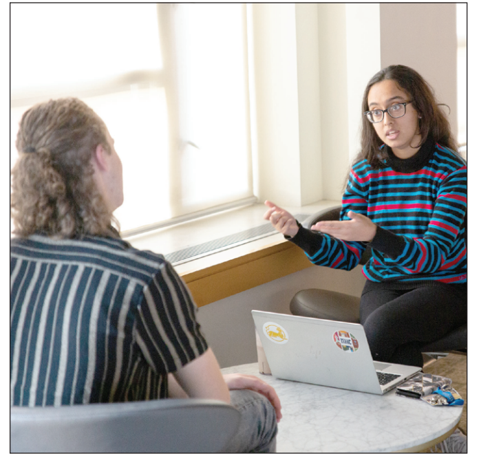
A conversation partner at the center, speaking in Hindi.

You can apply for classes and find more information about the center on their website, by visiting https://www.fivecolleges.edu/academics/languages/about .