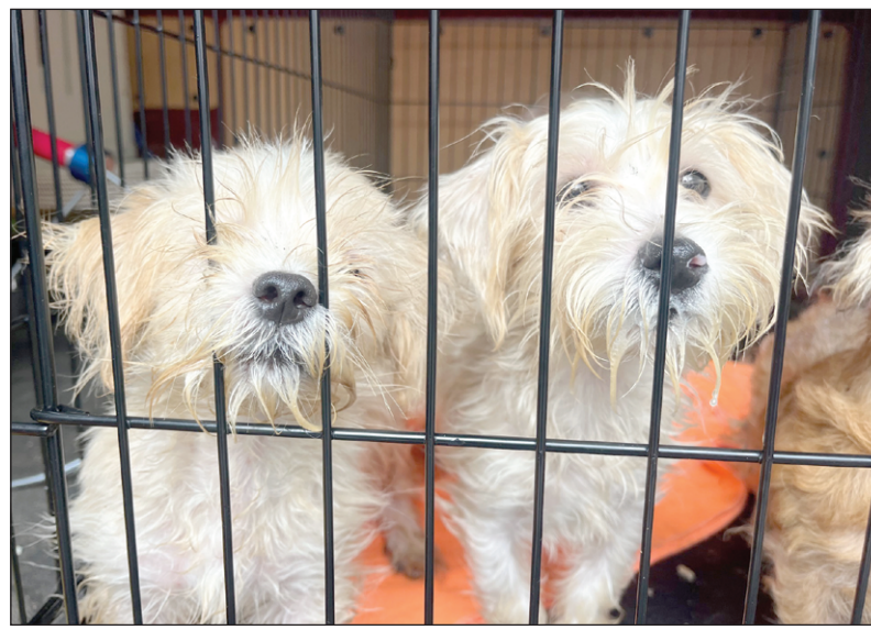
Second Chance Animal Services took in 23 small dogs to provide urgent medical care and support. These dogs will be available for adoption.

“At Second Chance, we are always ready to support our community’s ACOs. We work together to provide resources and expertise