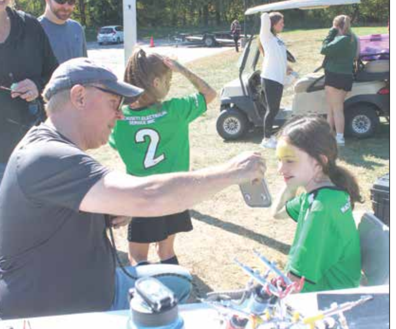
Face painting was featured during the Fall Bazaar.

This was the second year that the school has hosted a Fall Bazaar to support the senior class since bringing it back. Prior to the pandemic, the Fall Bazaar was a fun, annual event that gave seniors the opportunity to provide fun activities and reach out to the communi-