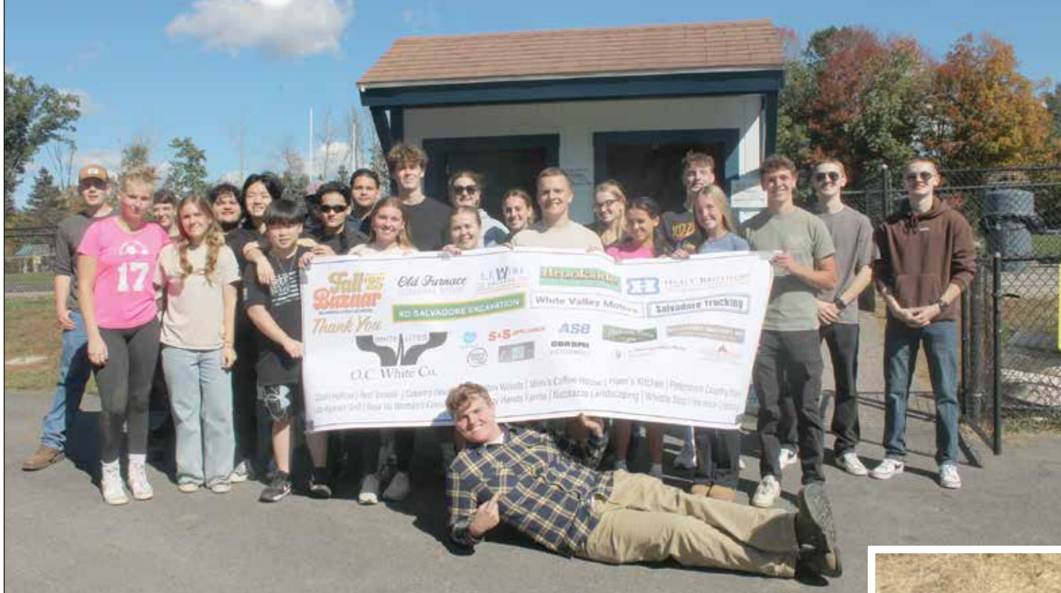
The Quabbin Regional High School Class of 2025 hosted a Fall Bazaar last Saturday. Seniors are shown with a banner featuring their supporting sponsors.