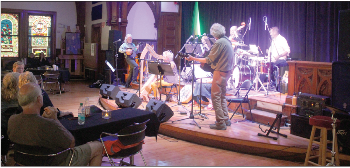
Workshop13 welcomed Wilde Irish Women to perform this past Saturday night.