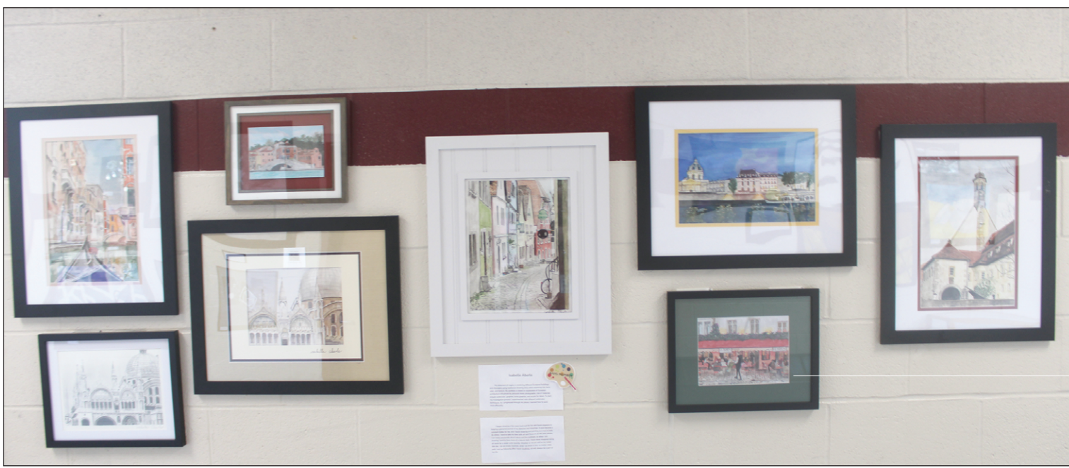
Artwork by Isabelle Aberle focusing on rendering different European buildings and cityscapes.