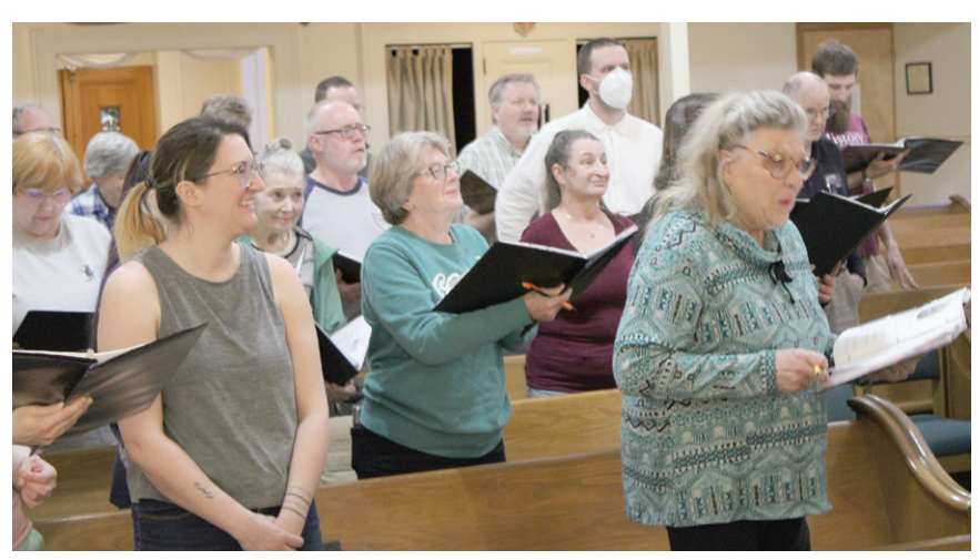
Wings of Song chorus members enjoy their time rehearsing.