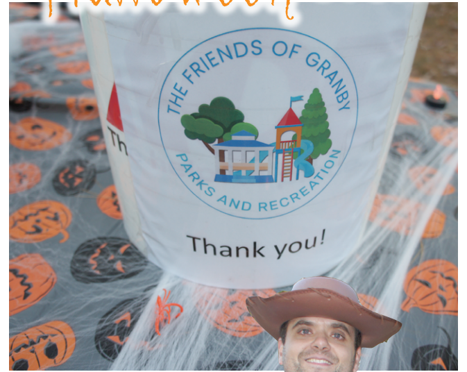
A thank you from The Friends of Granby Parks and Recreation.