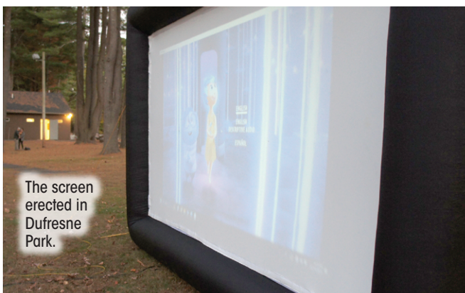
The screen erected in Dufresne Park.