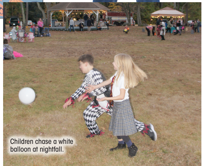
Children chase a white balloon at nightfall.