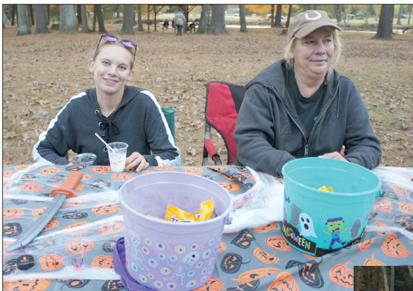
The Friends of Granby Parks and Recreation.