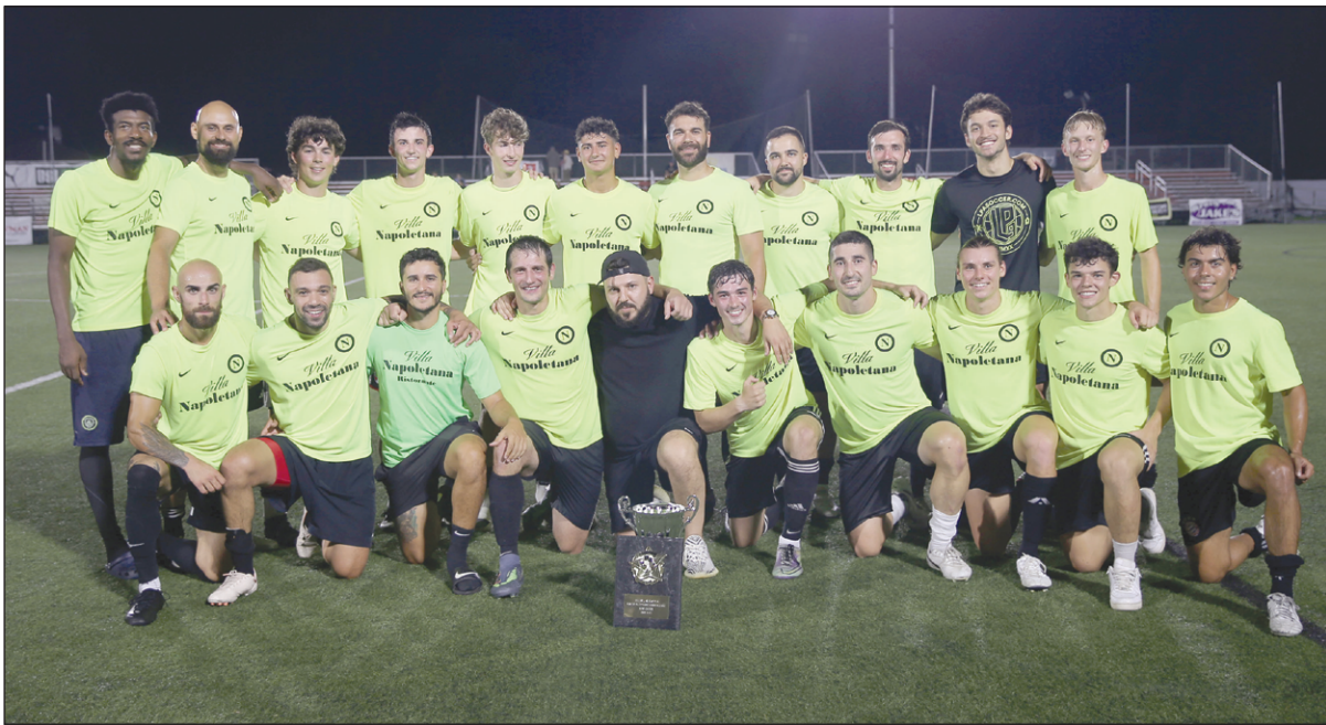
Villa FC captured the Men's Championship in the PVSSL earlier this month.