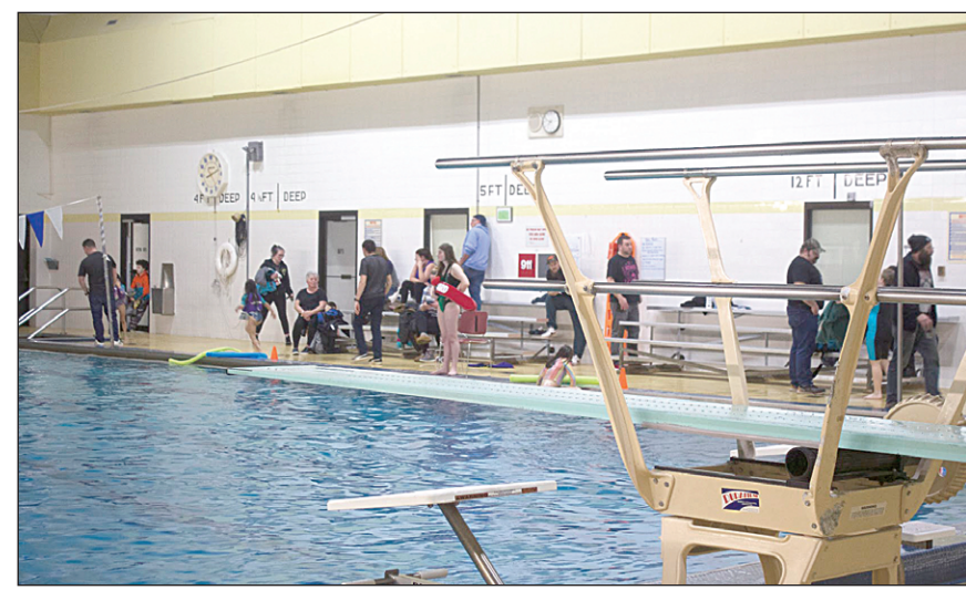
Parents and guardians watch as their kids swim at the Palmer High School pool.

However, donations were considered to offset the cost of future programs and student events.