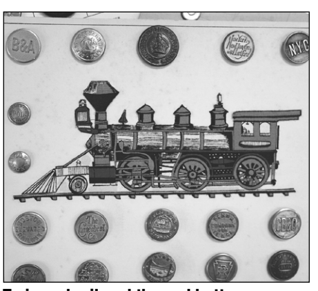
Train and railroad themed buttons were also popular among button collectors

These clubs include the Crescent Button Club, Monson Button Club, Shirley Button Club and Metropolitan