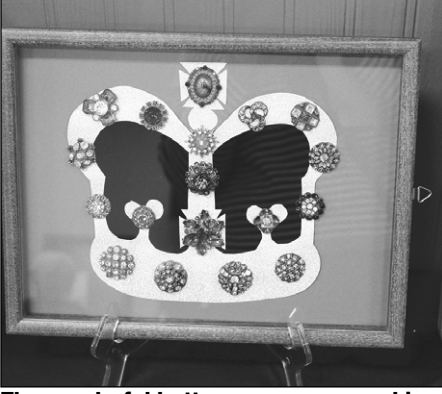
These colorful buttons were arranged in the shape of St. Edward's crown.

the youngest shopper found a button (or a dozen) to match their interests.