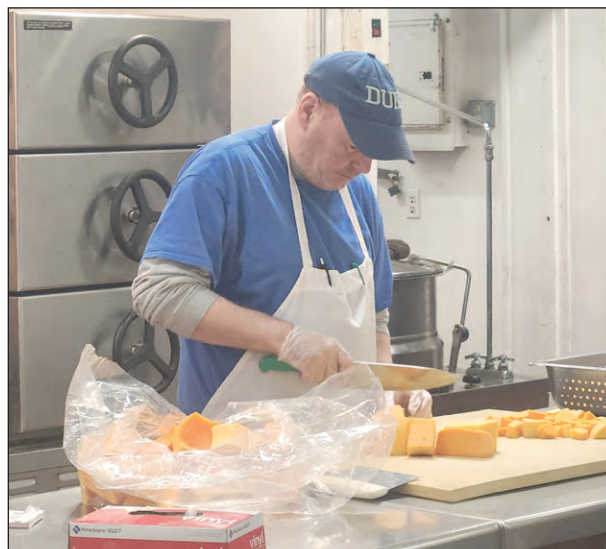
Members of the Knights of Columbus had different tasks to complete ahead of their big Thanksgiving Dinner, including chopping the squash.