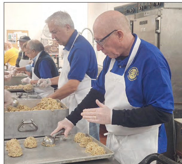
Members of the Rotary Club of Chicopee work like a food assembly line as they put together the bread stuffing scoops.