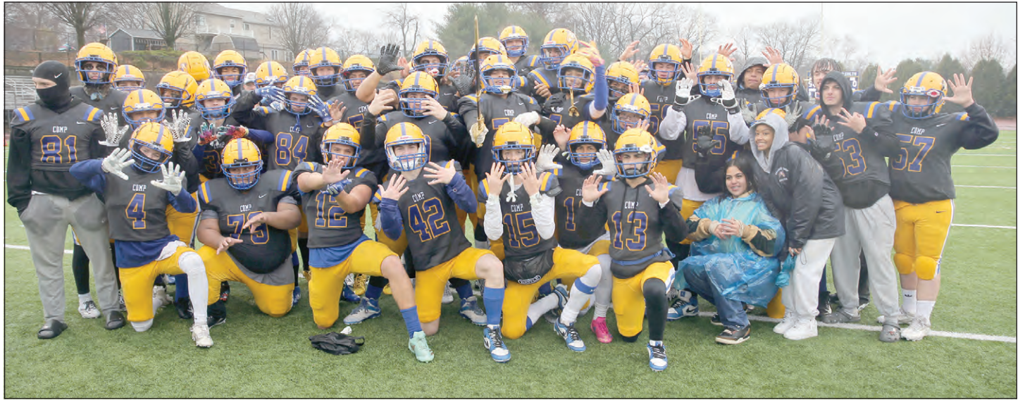
Chicopee Comprehensive once again celebrates victory in the Thanksgiving Sword Game.

CHICOPEE – Despite an impressive season from Chicopee High School this year, the Pacers were still no match for rival Chicopee Comprehensive on Thanksgiving morning. Playing in the pouring rain and raw conditions, Comp took it to High with a 52-0 rout last Thursday morning. Since moving the Sword Game to Thanksgiving morning, Comp has not lost to High.