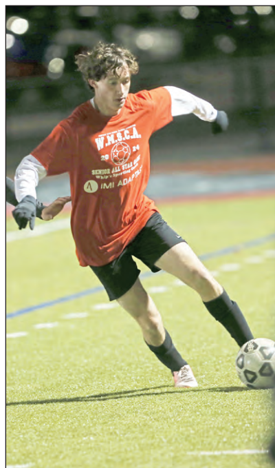
The Chicopee all-star makes his way toward the goal.