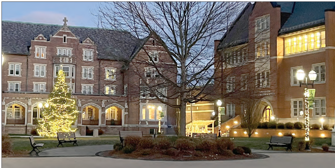
A beautiful shot of the Elms College quad with all the lights luminating the night after the Christmas Tree Lighting ceremony on Dec. 2.