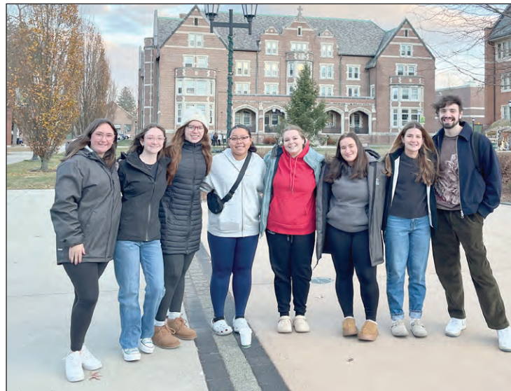
Students from Elms were happy to enjoy the hot drinks and sweet treats offered during the event.