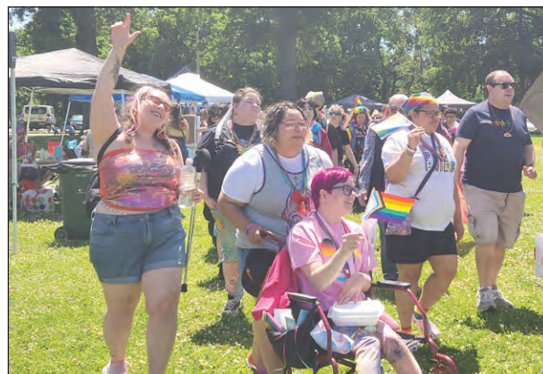
Residents show off and celebrate LGBTQIA+ pride during the sashay during Chicopee's 4th Annual Pride Fest at Szot Park.