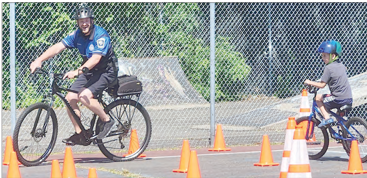
A Chicopee Police Officer Bike Patrol member guides a child through traffic cones on the obstacle course during the 3rd Annual Bike Rodeo

"It's just a good way for us to get out in the community so the kids can see us and interact and realize the different things that we offer. Our bike unit, it's summertime now, so they're out