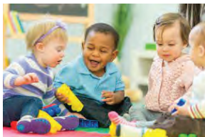
& Parenting Education