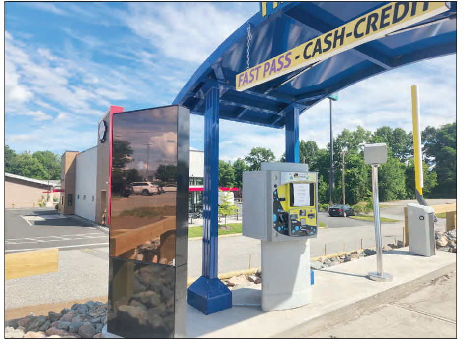
The kiosks or digital menus at the Golden Nozzle Car Wash on Memorial Drive in Chicopee.