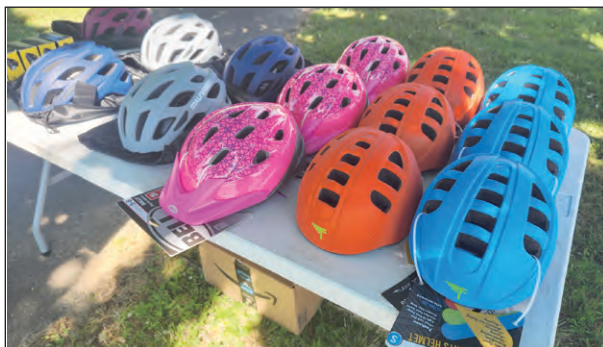
A collection of bike helmets as part of a helmet fitting station for the 3rd Annual Bike Rodeo at Ray Ash Park in Chicopee on June 15.