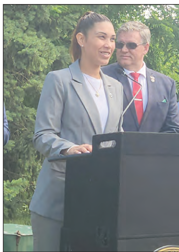
State Rep. Shirley Arriaga (D-Chicopee) provides remarks on Portuguese Heritage Month during the Portuguese Heritage Month Flag Raising ceremony in Chicopee on June 10.

"But, if we understand that it's bigger than ourselves, it's bigger than us, and when we see that, that spirit of Portuguese Americans is embodied by this day on June 10 as we celebrate