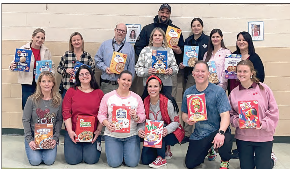
Posing with their favorite cereal flavors and brands, the group yelled out "Cereal!" and smiled for the camera before cleaning up all the boxes.