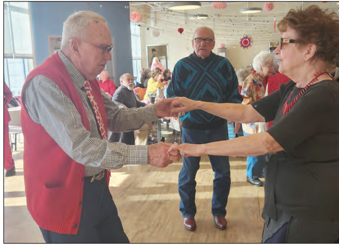
A couple gets lost in the music as they share a special dance together during the Valentine's Day Dance at the RiverMills Senior Center on Feb. 14.